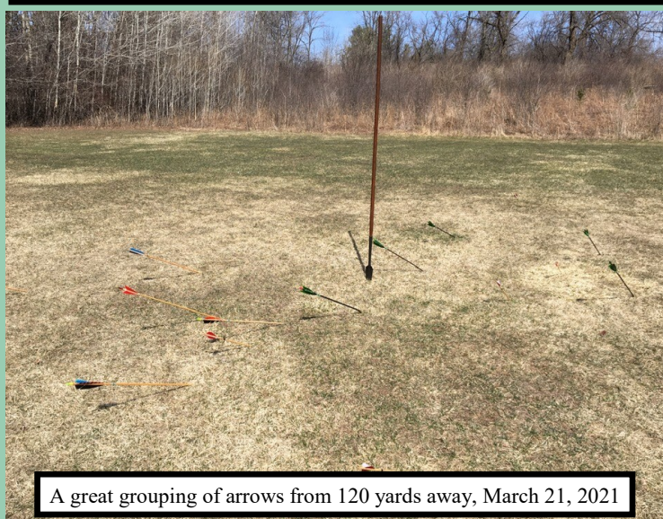
A great grouping of arrows from 120 yards away, March 21, 2021